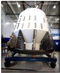
Dragon test article used for parachute testing

SpaceX's crew transportation system is based on the Dragon spacecraft and Falcon 9 launch vehicle originally developed for International Space Station cargo missions.