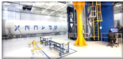
Falcon 9 first stage at SpaceX headquarters

Initially designed to carry cargo, the Dragon's components are being modified for added safety and crew accommodations.