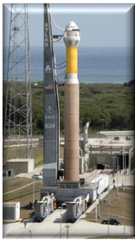
Artist concept of integrated CST-100 and Atlas V rocket

Boeing's crew space transportation system is comprised of its reusable CST-100 spacecraft, the United Launch Alliance Atlas V launch vehicle, mission operations and ground systems.