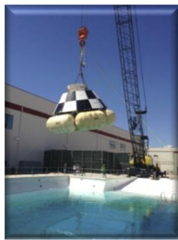
CST-100 water contingency landing scenario testing