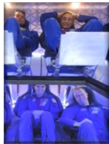
Astronaut fit-check in the Dragon

Initially designed to carry cargo, the Dragon's components are being modified for added safety and crew accommodations.