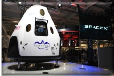
Dragon V2 at SpaceX headquarters

SpaceX's crew transportation system is based on the Dragon spacecraft and Falcon 9 launch vehicle originally developed for International Space Station cargo missions.