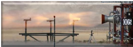
Launch abort engine hot-fire test in California